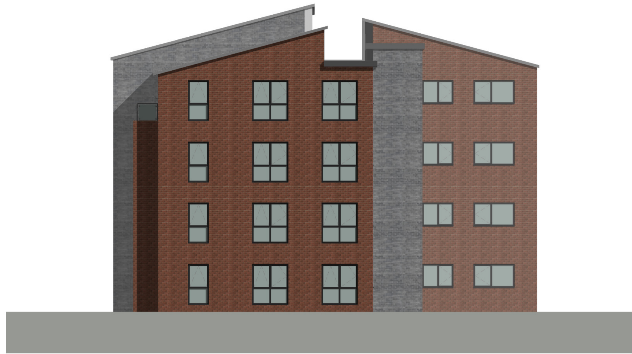
1 South 1 : 100