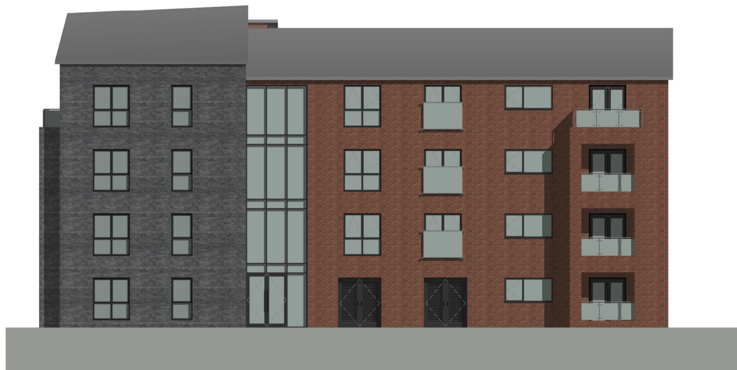
3 West 1 : 100