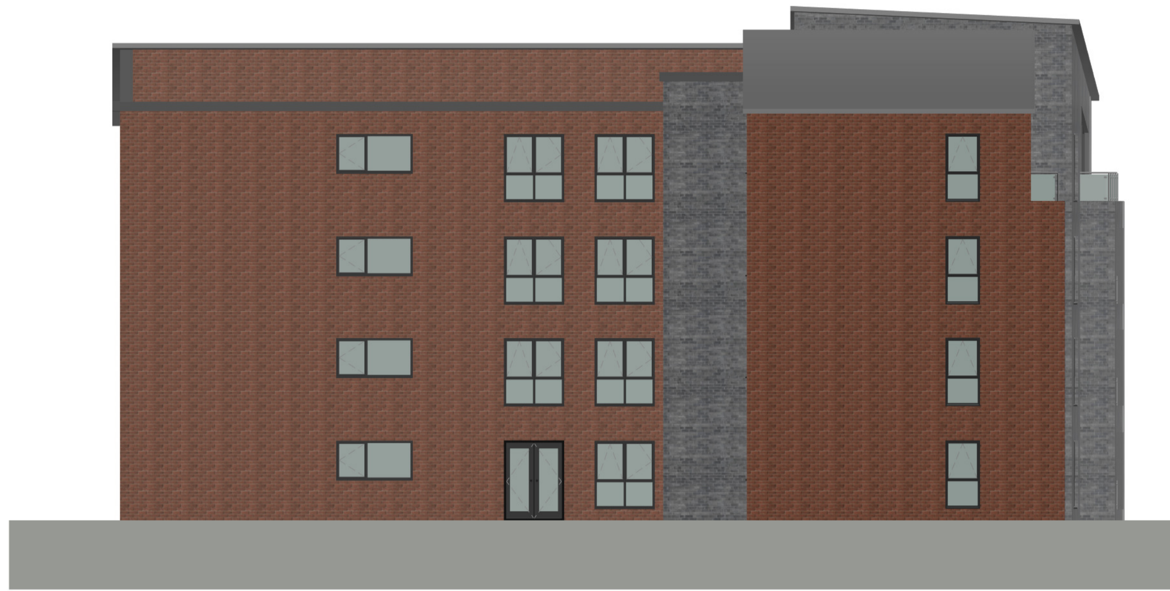
2 East 1 : 100